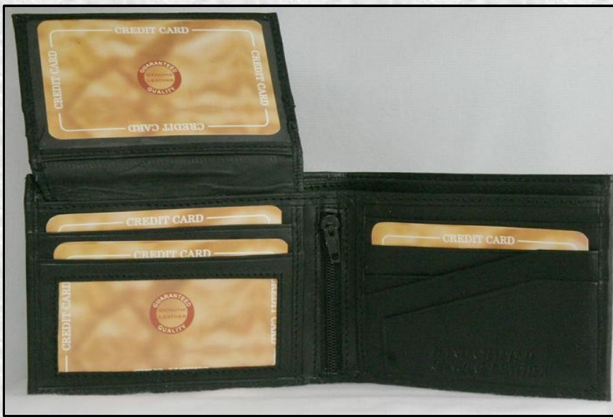
LR-2513 Top Grain Leather Bi-Fold Wallet -Black or Brown

Quality, hand-crafted genuine soft leather bi-fold wallet. Includes; Divided currency storage, 8 credit card pockets, two Interior ID windows, zipper storage, removable photo storage sleeve (not shown), and more. Measures 3.25" x 4" closed. $4.50ea