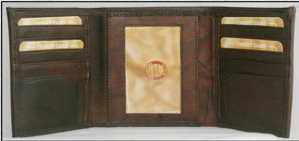
LR-2510- Top Grain Leather Tri-Fold Wallet -Black or Brown

Quality, hand-crafted genuine soft leather bi-fold wallet. Smaller "front Pocket" style . Includes; currency storage, credit card pockets and a removable photo storage sleeve. Measures 3.75" x 3" closed $5.00ea.