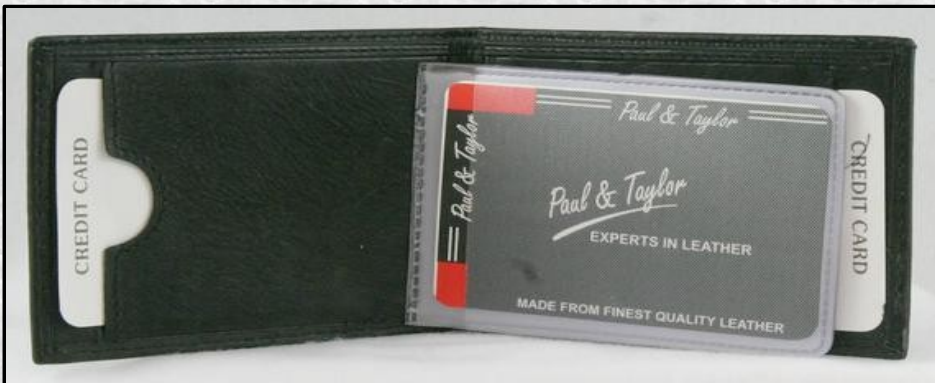
LR-2508 Top Grain Leather Bi-Fold Pocket Wallet – Black or Brown

Quality, hand-crafted genuine soft leather bi-fold wallet. Includes; Divided currency storage, 8 credit card pockets, two Interior ID windows, zipper storage, removable photo storage sleeve (not shown), and more. Measures 3.25" x 4" closed. $4.50ea